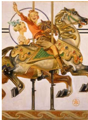
Leyendecker, J.C. Carousel, Saturday Evening Post 26 x 18 inches