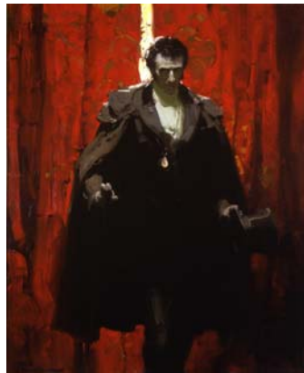
Schaeffer, Mead Count of Monte Cristo , 1928 32 x 26.25 inches