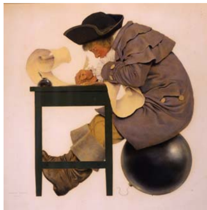
Parrish, Maxfield Young America . . . , 1909 16 x 15.75 inches