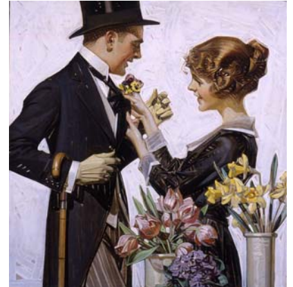
Leyendecker, J.C. Florist , 1920 Oil on canvas 20.25 x 19.50 inches