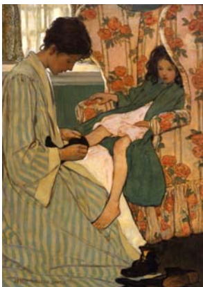
Smith, Jessie Willcox Mother's Morning 23 x 15.50 inches