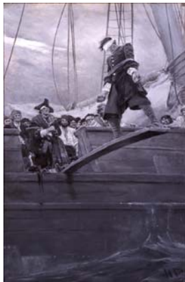
Pyle, Howard Walking the Plank 19.50 x 13 inches