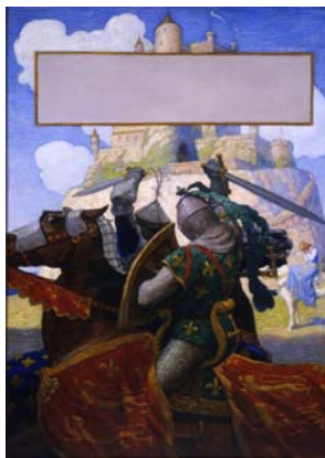
N. C. Wyeth The Boy's King Arthur , 1917 39 x 28 inches